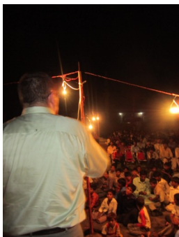
Preaching the love of Jesus to the people.